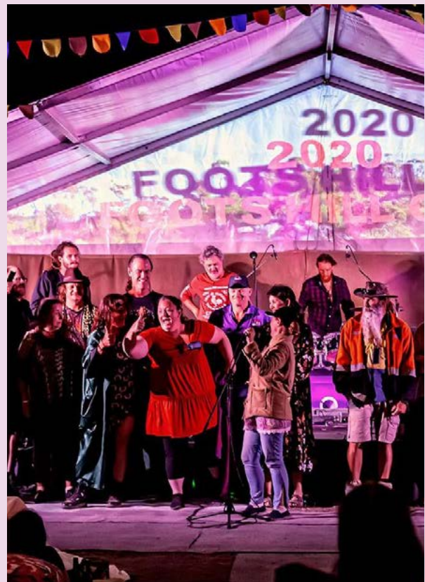
Group shot of organisers and volunteers

October 2020, Calcium. Participating artists were from Townsville, Charters Towers, Mission Beach, Cairns, Port Douglas, Mackay, and the Sunshine Coast.