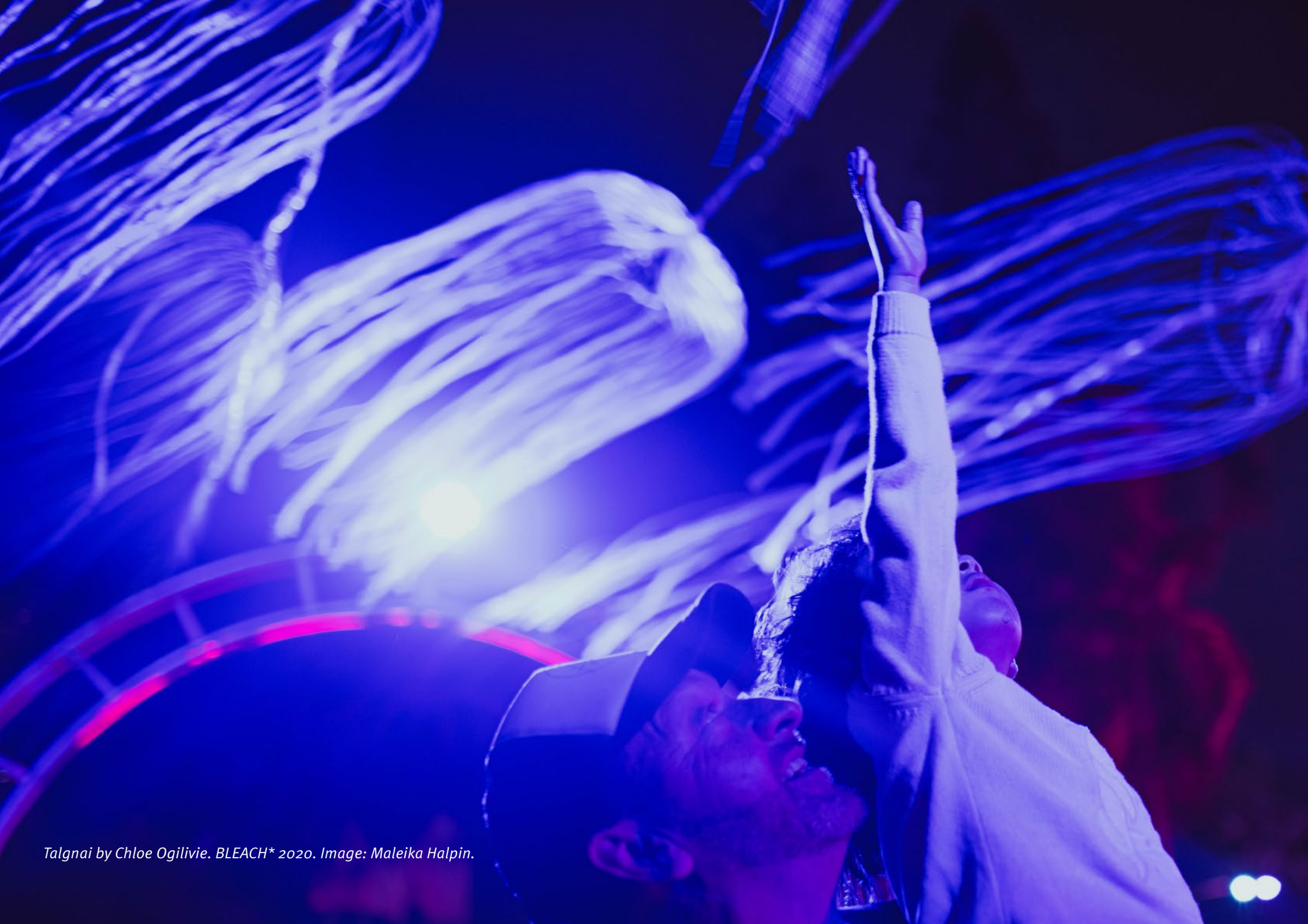
Talgnai by Chloe Ogilvie. BLEACH* 2020.