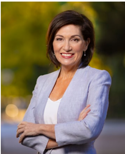
The Honourable Anastacia Palaszczuk MP Premier of Queensland Minister for the Olympics

Over the next four years, Grow 2022-2026 will nurture a brighter, bolder, more diverse and more sustainable creative landscape for our State.