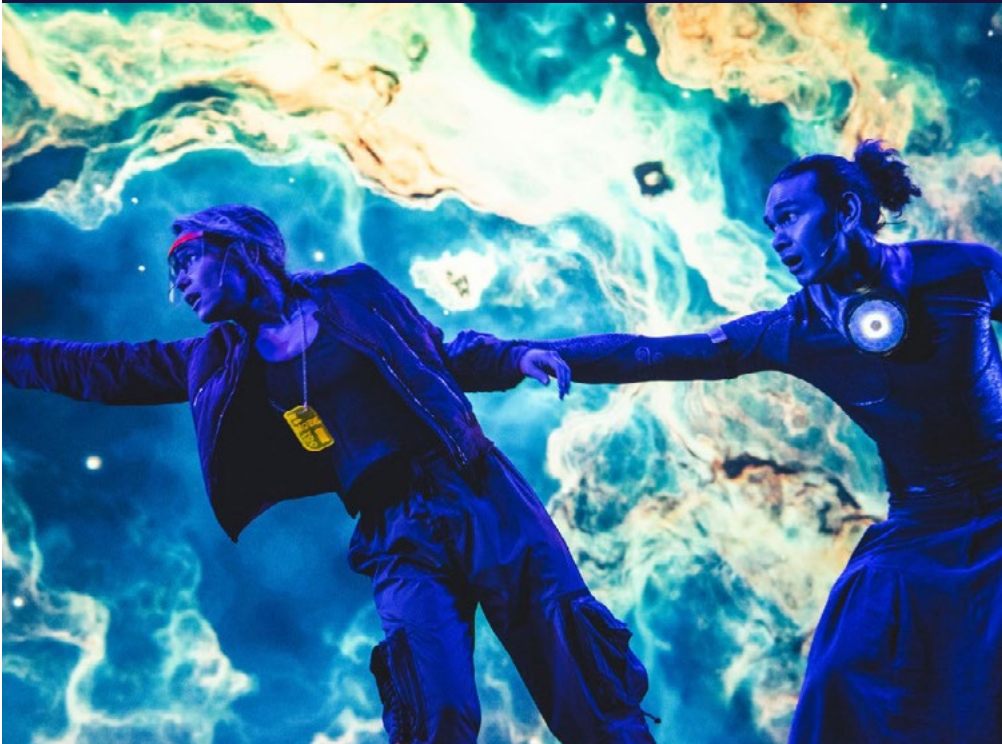
Ishmael a Dead Puppet Society, Queensland Performing Arts Centre, and Brisbane Festival production in association with Screen Queensland, is a reimaging of Moby Dick as a contemporary space saga.

A focus on the development of Queensland's arts, cultural and creative sector's capability and capacity will facilitate sector and creative business growth and increase training and employment opportunities.