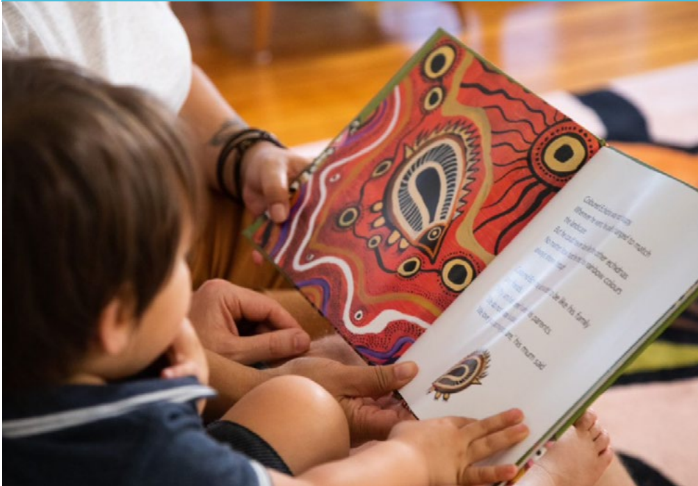
The State Library of Queensland's Stories for Little Queenslanders, showcase Queensland settings, characters and stories, including a story about a cow's hapless journey down a flooded Brisbane River and an alphabet book featuring echidnas exercising in Emerald.

Actions in Grow 2022-2026 will focus on the development and presentation of uniquely Queensland works, celebrating the state's brightest talent and nurturing our future storytellers. The sharing of Queensland's unique and diverse stories will enrich the state's cultural reputation.