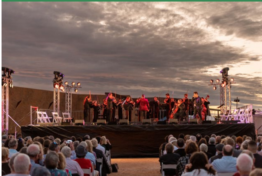
Festival of Outback Opera 2022 in Winton. The Opera Queensland event was a program of outdoor performances in regional Queensland communities. The Festival was supported by the Queensland Government through Arts Queensland and Tourism and Events Queensland. Performances were presented in association with The University of Queensland in collaboration with the School of Music.

Actions in Grow 2022-2026 will focus on enhancing community-led arts experiences across Queensland which are underpinned by inclusive and sustainable cultural infrastructure.