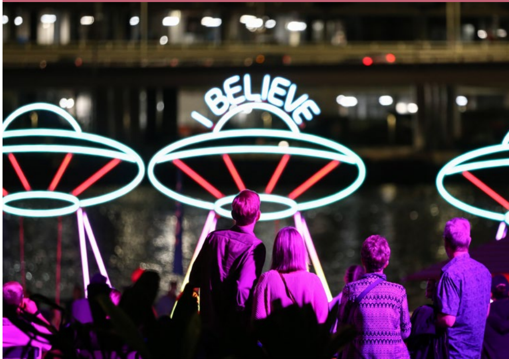
I Believe Swings by ENESS, Brisbane Festival 2021.

Actions in Grow 2022-2026 will support impactful community outcomes that advance social and economic priorities. This will be achieved by working to enhance local arts activity through partnerships and locally led arts engagement.