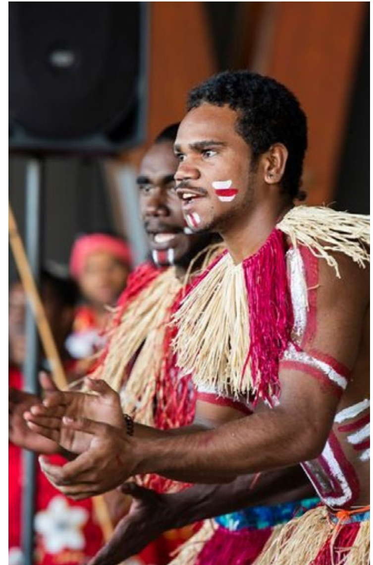
Lockhart River Kwadji Wimpa Dance Group at Cairns Indigenous Art Fair 2022.

Arts Queensland (within the Department of Communities, Housing and Digital Economy) will lead the implementation of Grow 2022-2026 across the Queensland Government in partnership with key stakeholders.