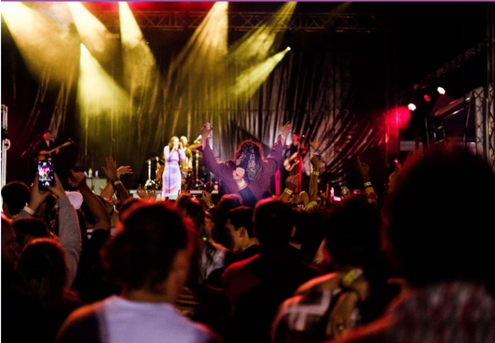
Thelma Plum performing at Tropic Sounds, as part of North Australian Festival of Arts 2022.

Actions in Grow 2022-2026 focus on building strong foundations that will drive arts and culture led economic outcomes across Queensland ahead of Brisbane 2032 and enable a significant legacy. These actions will work to deliver regional growth and inclusive participation and will underpin the state's vision of establishing Queensland as an iconic cultural tourism destination.