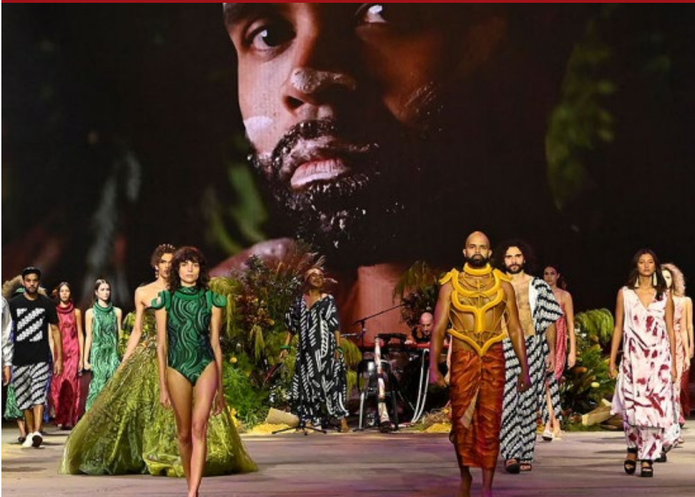
First Nations Fashion: Walking In Two Worlds at the 2021 Brisbane Festival brought together Indigenous fashion dance, film and live music. Works were exhibited as part of the Australian Fashion Week 2021.

Actions in Grow 2022-2026 will foster partnerships, exchange and collaborations that strengthen and celebrate culture and country. Investing in opportunities to showcase and present the state's unique stories and knowledge will ensure Brisbane 2032 is a powerful celebration of First Nations arts and cultures in Queensland.